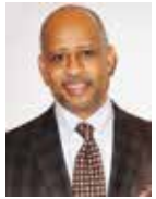
Playwright Ruben Santiago-Hudson

An Upper West Side dinner party invitation brings an unlikely group together, spawning a passionate and explosive debate on America's relationship to race. Tony Award-winner Ruben Santiago-Hudson brings humor and poignancy to one of the most potent conversations in American life. In our shared history, we all sing the blues. But are your blues sweet like mine?